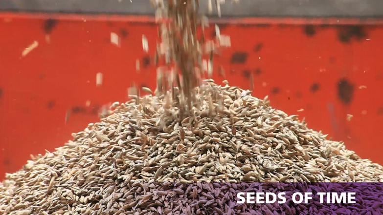
SEEDS OF TIME