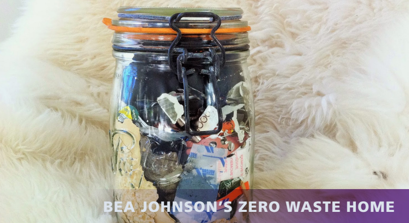
BEA JOHNSON'S ZERO WASTE HOME