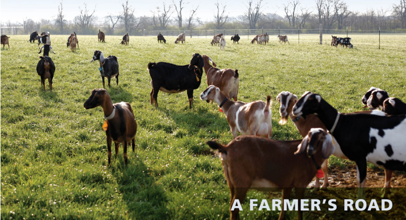
A FARMER'S ROAD